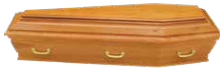
Bann European pine coffin with a satin finish.