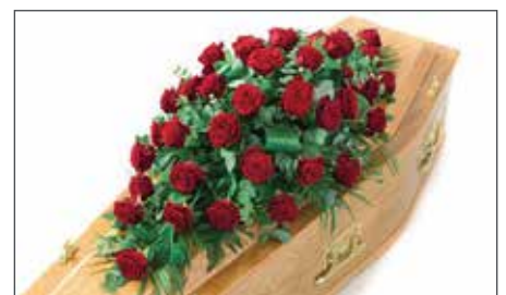
Floral Tributes - Rose Coffin Spray