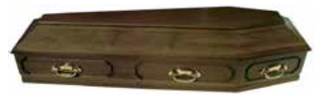
Derg African ayous wood with a matt finish.