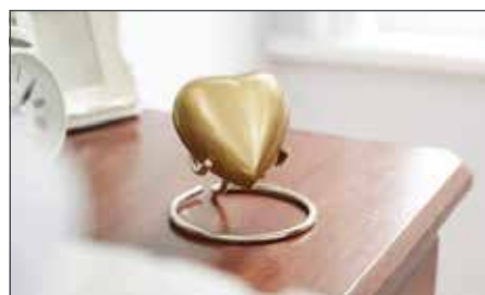
Memories - Heart Shaped Keepsake