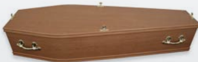
Wood effect coffin featuring flat lid and sides

We are here for you 24 hours a day 365 days a year