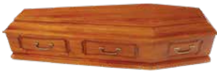
Lagan South American kiri wood coffin with a gloss finish.