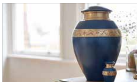
Memories - Anoka Urn